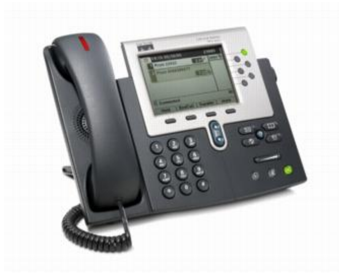
Figure 2. Close-Up of High-Resolution Display and Lighted Line Keys