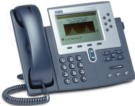
Figure 1. Cisco Unified IP Phone 7960G

The Cisco Unified IP Phone 7960G, a key offering in the IP Phone portfolio, is a full-featured IP phone primarily for manager and executive needs. It provides six programmable line/feature buttons and four interactive soft keys that guide a user through call features and functions. Audio controls for duplex speakerphone, handset and headset. The Cisco Unified IP Phone 7960G also features a large, pixel-based LCD display. The display provides features such as date and time, calling party name, calling party number, and digits dialed. The graphic capability of the display allows for the inclusion of such features as XML (Extensible Markup Language) and future features.