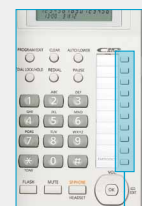
One-Touch Dial Buttons

You can store up to 20 phone numbers in the one-touch dial buttons (10 numbers in both upper and lower memory locations). One-touch dial buttons save you time and trouble when calling a client, customer, or associate you often speak with.