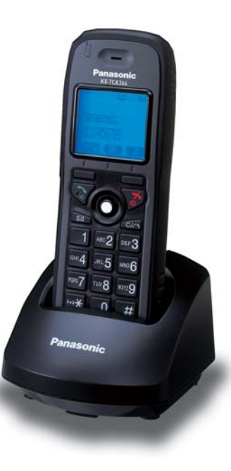
KX-TCA364 Tough Type Model