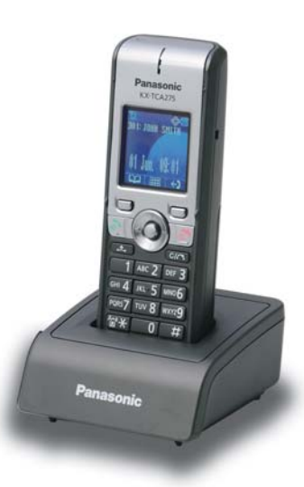
KX-TCA275 Compact Business Model